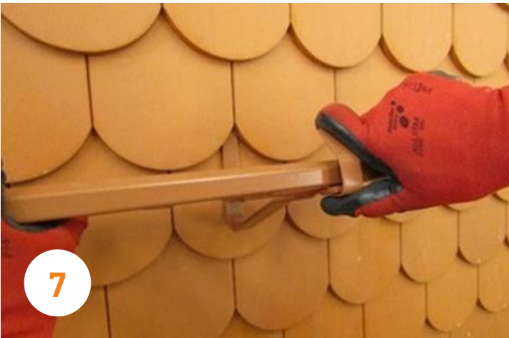
Place the grid to the rail! The overhang of the grid has to be lower than the \frac{1}{3} part of the support distance!