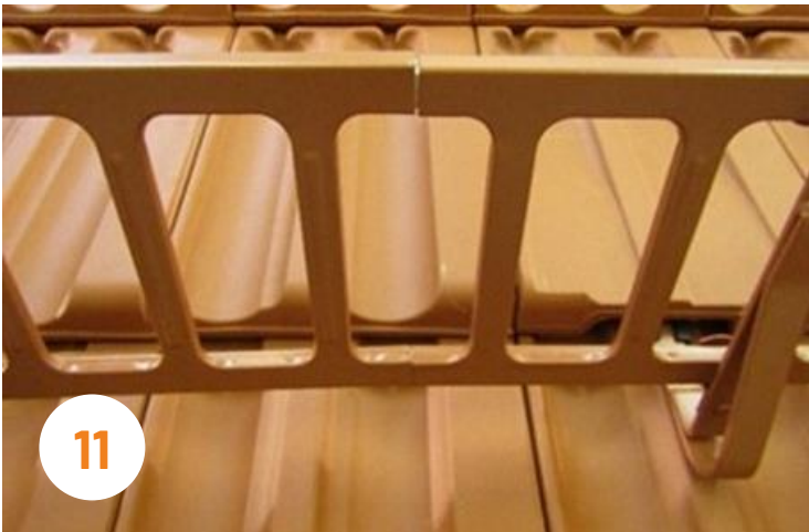
The connection does not require additional fixing!