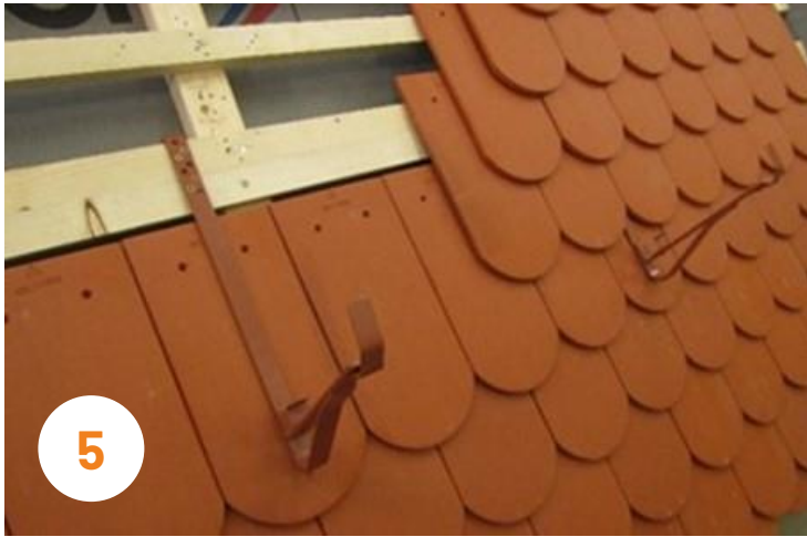
Finish the tile cover!