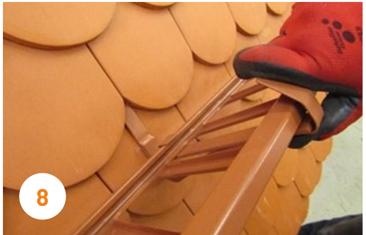
Blend the upper fixing plate by hand to fix the grid!!