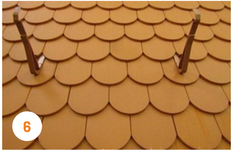
Use base tiles above the supports!