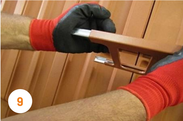
Use the two joiner to connect the grids to avoid the further deflections!