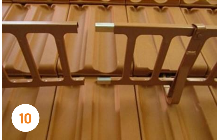
Place the joiners to the rail by hand.